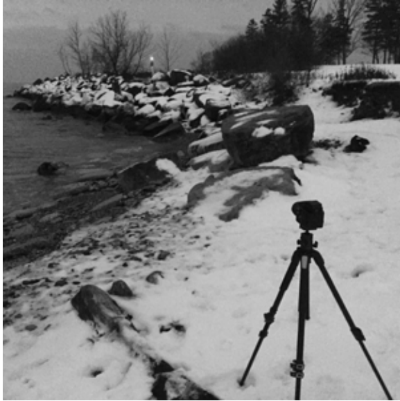
Humber Bay Park, Toronto, Ontario January - March 2018 Photographed on Kodak Ektar 100 film Processed in West Toronto